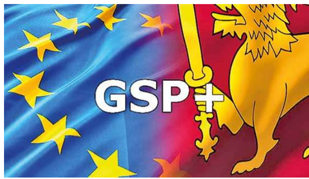
GSP+: Isn't there a way out?