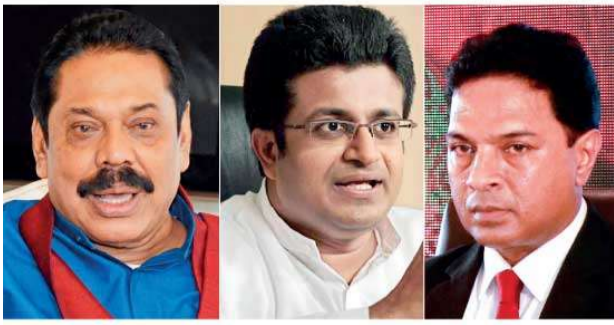
SLPP eats humble pie over fuel price hike statement