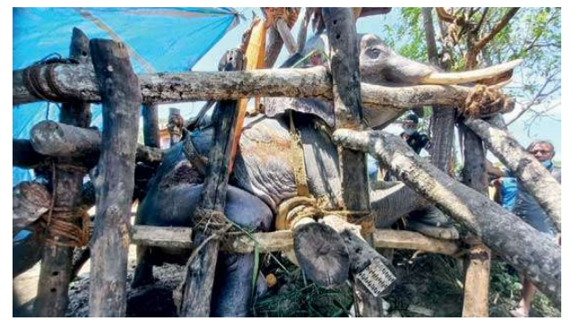
Vavuniya tusker's demise DID TOO MANY 'COOKS' SPOIL JUMBO'S RECOVERY?