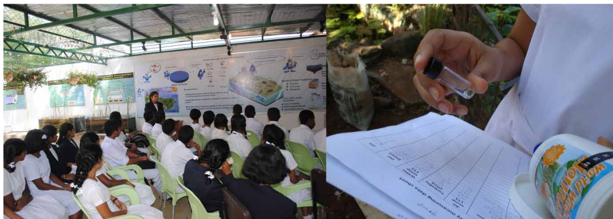
Figure 3 | L-R: Creating floating wetland models at the Mahamaya Girls' College; a student demonstrating water quality checks using a World Water Day kit.

The project 'Mitigation of Pollution in Kandy Lake and Mid-Canal, Sri Lanka' was officially handed over to Kandy stakeholders and authorities on 10 July 2014. Since then, developments in Kandy's water and sanitation infrastructure have been continuing. The local authorities believe that the success of the Kandy Lake project helped trigger, and provide momentum and support for the ongoing developments.