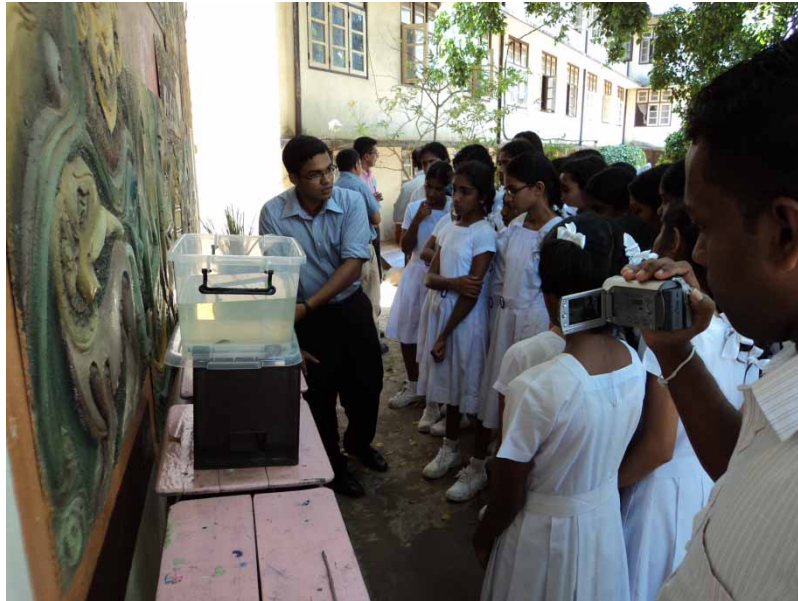
Figure 4 | UOP undergraduate demonstrating how constructed wetlands work.