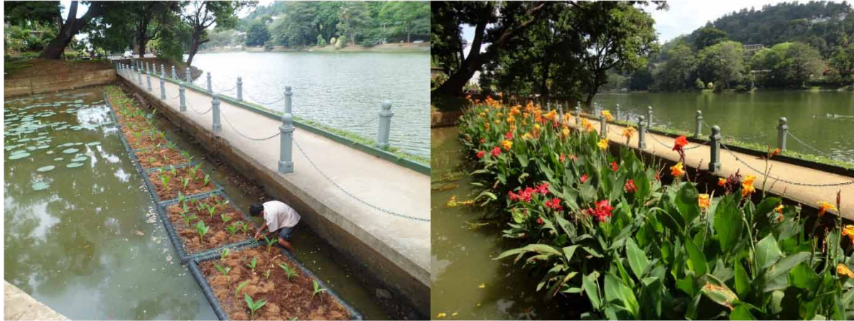
Figure 1 | Completion of 1st phase of wetland installations.

Floating wetlands were designed by the project team, tested, and installed at major inlets to the lake, as a passive water treatment and protection system (Figure 1). Installation was preceded by hydraulic modelling of the lake to enable strategic wetland module placements (Pu et al. 2011). A local wetland plant ( Canna iridiflora ) was selected, considering both growth rates and aesthetics (Weragoda et al. 2012). Floating wetlands were selected because these: (1) take up excess nutrients and reduce sedimentation of larger particles without consuming energy; (2) require virtually no land space, which is scarce in Kandy; (3) are easy to control and maintain, as the plants will not grow outside the float, and the floats can be anchored at the most effective locations, and (4) integrate naturally into and beautify the surroundings (Vymazal 2007).